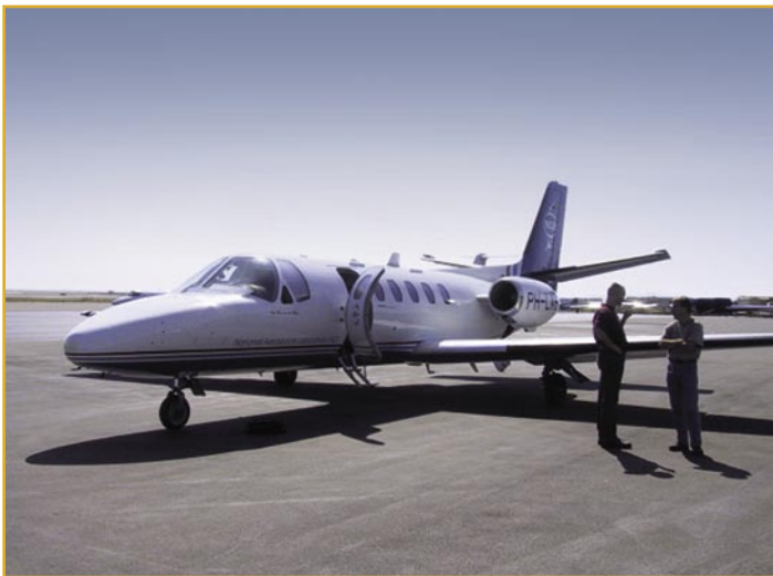
NLR's Cessna Citation II Research Aircraft

The flight-tests took place on 26 th and 27 th September 2001 using NLR's Cessna Citation II research aircraft. EGNOS was investigated in two different ways: firstly by applying the ESTB position and integrity data to support flying curved approach procedures; and secondly, by providing ILS look-alike ESTB guidance to fly the standard straight-in approach to Nice over the Cap d'Antibes. The results were processed using real-time kinematic GPS as the truth. From these, it was concluded that the ESTB met the demanding integrity and accuracy requirements for APV II precision approach. Most importantly, the pilots themselves were very complimentary ... "Basically it was easy to fly the curved approaches using guidance from the ESTB ... in general